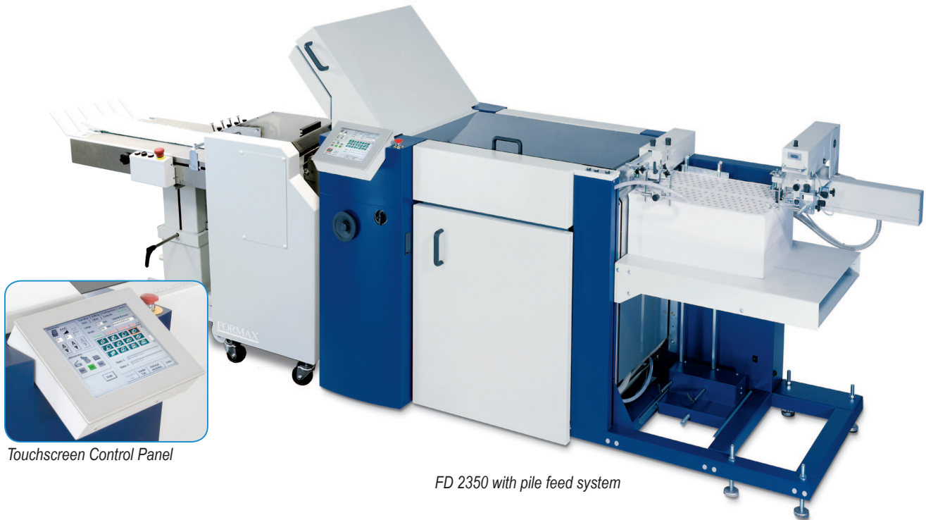
Touchscreen Control Panel